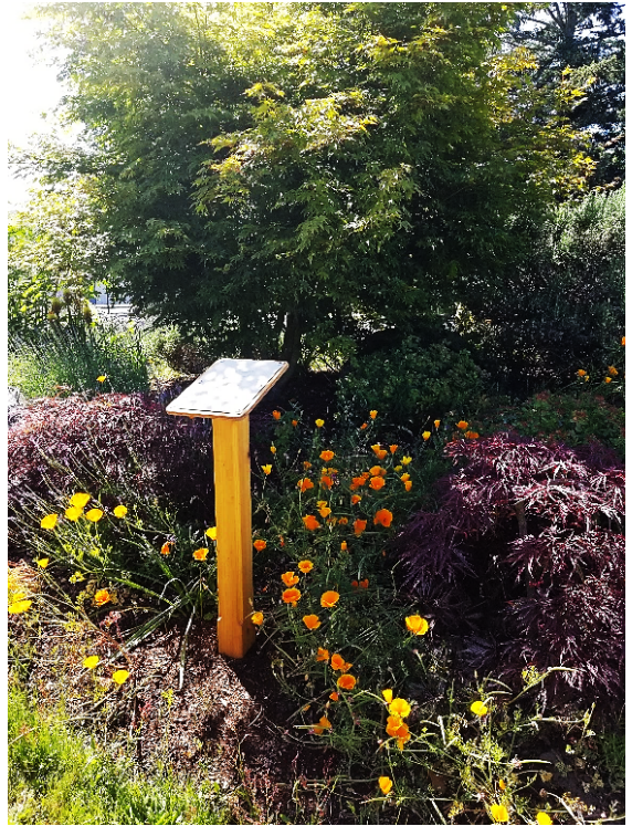
Poetry Gardens Project ~ 2020