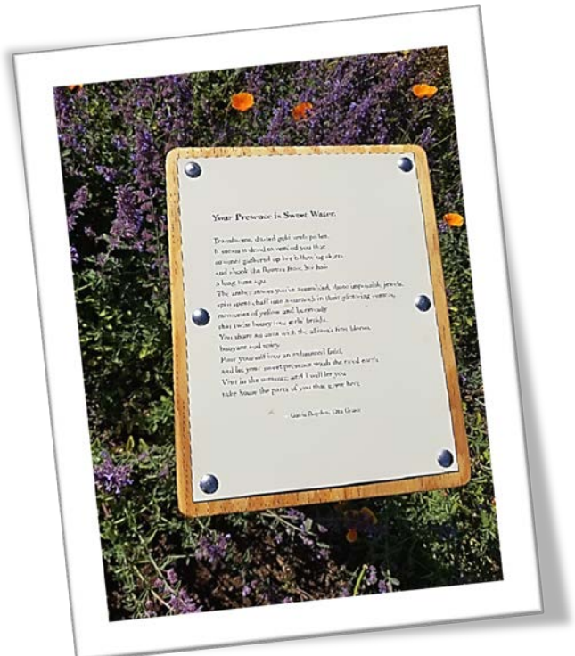
Poetry Gardens Project ~ 2020